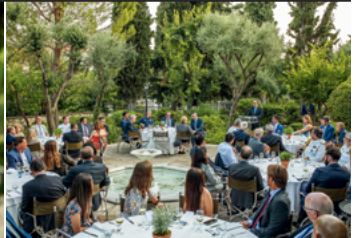
GENERAL VIEW FROM THE USA PAVILION RECEPTION THAT TOOK PLACE AT THE GENNADEION GARDENS OF THE AMERICAN SCHOOL OF CLASSICAL STUDIES

T aking place on July 13-15 at the Metropolitan Expo exhibition center at Athens International Airport Eleftherios Venizelos, DEFEA 2021, the first biennial Defense Exhibition Athens, was a resounding success. Organized under the auspices of the Hellenic Ministry of National Defense and the Hellenic Ministry of Shipping, the exhibition was supported by the Hellenic Aerospace Security and Defense Industries Group (HASDIG) and the Hellenic Association of Space Industry, and had SEKPY-Hellenic Manufacturers of Defense and Security Material Association as its strategic partner. Highlighting Greece as a strategic regional hub, DEFEA brought together defense and security industry stakeholders from across Europe, Asia, Africa and the Middle East, as well as the United States.