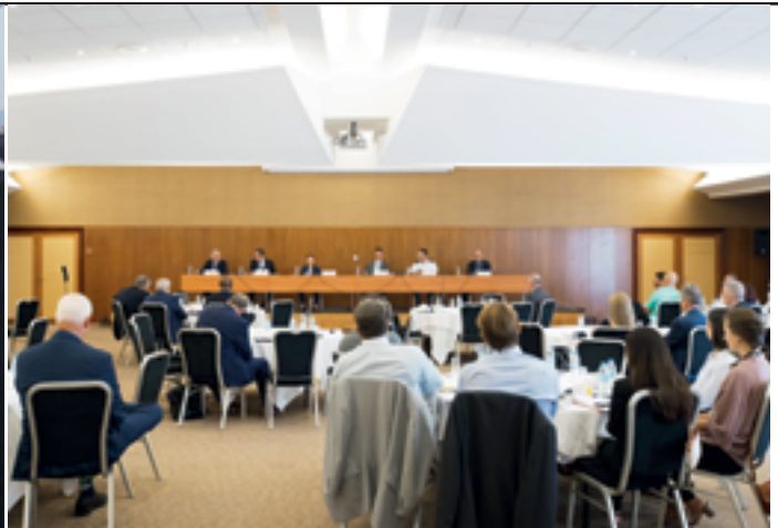
USA PAVILION EXHIBITORS' BREAKFAST BRIEFING

“This trade show not only presents an opportunity to meet with our international partners but also with our partners in the defense industry who play an equally important role in achieving our defense and national security objectives. [...] Thanks again to AMCHAM for hosting. On behalf of my colleagues from the DoD, I want to thank you again for your continuous teamwork to ensure that we remain the global security partner of choice.”