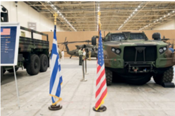
HEAVY MILITARY VEHICLES DISPLAYED BY THE US ARMY