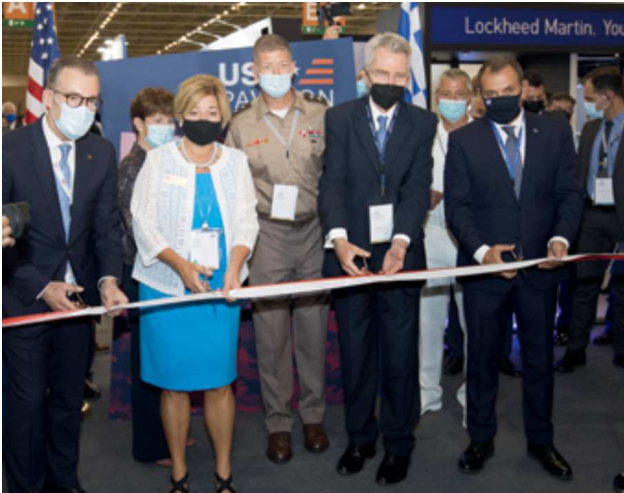
USA PAVILION RIBBON CUTTING CEREMONY

Without a doubt the reference point at DEFEA 2021, the USA Pavilion was organized by the American-Hellenic Chamber of Commerce with the support of the United States Embassy in Athens, in association with AUSA Hellenic Chapter. The Pavilion presented state-of-the-art equipment, services and heavy vehicles and helicopters of the US Army, attracting defense industry professionals, who toured its corridors, learned about the exhibits and exchanged views on further strengthening the partnership and ties between Greece and the United States.