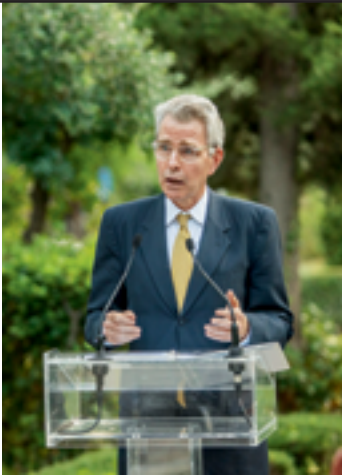
GEOFFREY R. PYATT