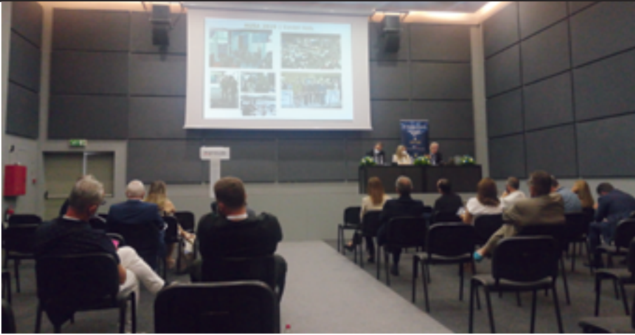
THE AUDIENCE AT THE EVENT ANNOUNCING THE ORGANIZATION OF THE HELLENIC PAVILION AT AUSA 2021